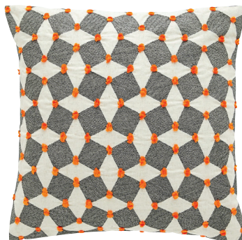
Irina embroidered cushion | £55

Has little orange tufts to add texture and colour. Will cheer up any sofa, no matter how tired. habitat.co.uk