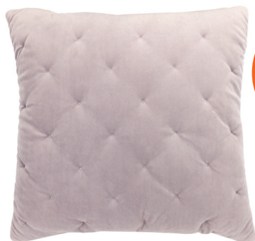
Renaissance quilted grey cushion | £14

The quilting detail lifts this cushion from the ordinary to the really quite swanky. sainsburyshome.co.uk