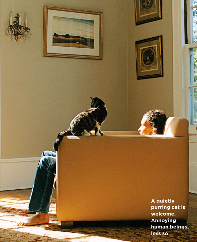
A quietly purring cat is welcome. Annoying human beings, less so.