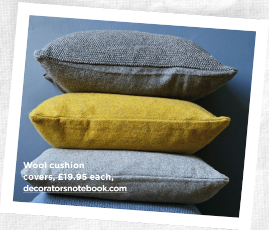
Wool cushion covers, £19.95 each, decoratorsnotebook.com

Add piping perhaps, or introduce zips or buttons. For an excellent tutorial with helpful, but not free, video (£4.95 for 24 hours), go to sew-helpful.com . Dorling Kindersley's Handmade Interiors is a sensible and uncomplicated guide to making cushions and soft furnishings (it also includes bolsters, round cushions and others).