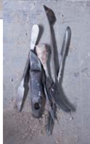
TOP Halima works on an as-yet-untitled piece to be shown at an exhibition in New York; Deep hollows are a characteristic motif in much of Halima's work; a collection of Halima's sculpting tools

division and symmetry with meticulous measuring. This surface design is then transferred on to the three-dimensional form and then the carving can begin. 'Carving is my favourite part,' she says. 'I work out which way to carve beforehand so that I don't make any mistakes but, once that's done, it becomes a meditative process.'